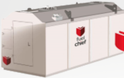
DC200 - 15,000L (18,780 SFL)