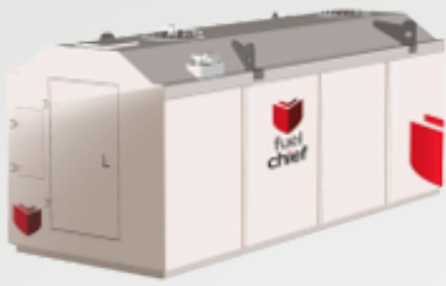
DC200 - 15,000L (18,780 SFL)