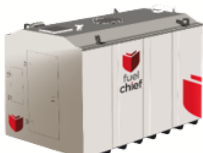
DC150 - 15,000L (14,780 SFL)