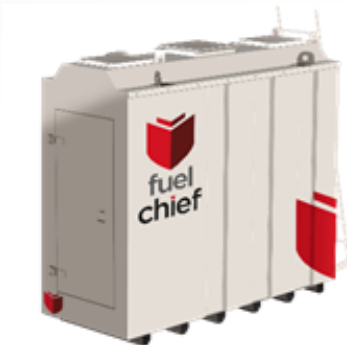
DC50 - 5,000L (4,755 SFL)