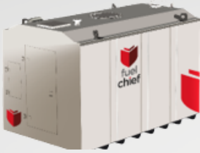
DC150 - 15,000L (14,780 SFL)