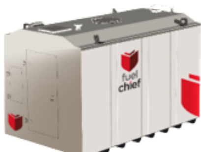
DC150 - 15,000L (14,780 SFL)