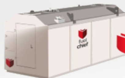
DC200 - 15,000L (18,780 SFL)