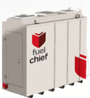
DC50 - 5,000L (4,755 SFL)