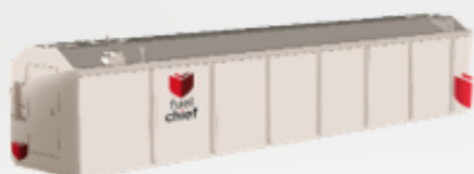
DCD450 - 45,000L (40,860 SFL)