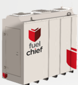
DC50 - 5,000L (4,755 SFL)

The Industry package has all the features that the Business packages offers, however incorporates the Sapphire Online or Everlink AFM (E)* fuel management system. This is the premium option when it comes to monitoring your fuel with advanced real-time technology. This option is perfect if you have a fleet of vehicles on one site or across a number of sites and require real-time data in one place. This package includes users who may have vehicles which are re-fuelling at both a company yard tank and retail fuel outlets or truck stops. Listed below are the Industry Series package options: