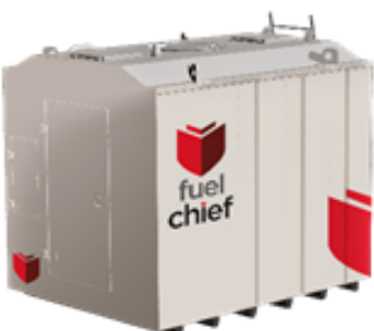
DC100 - 10,000L (9,900 SFL)