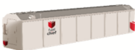
DCD450 - 45,000L (40,860 SFL)