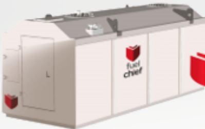
DC200 - 15,000L (18,780 SFL)