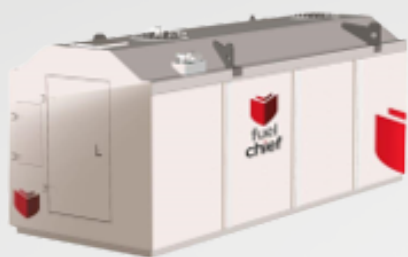
DC200 - 15,000L (18,780 SFL)