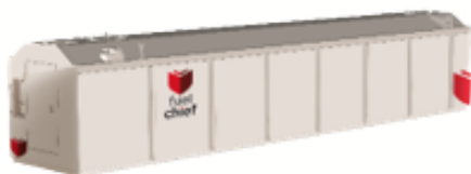
DCD450 - 45,000L (40,860 SFL)