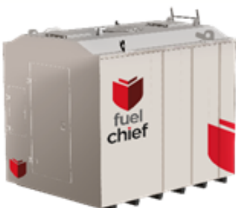
DC100 - 10,000L (9,900 SFL)