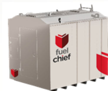
DC100 - 10,000L (9,900 SFL)