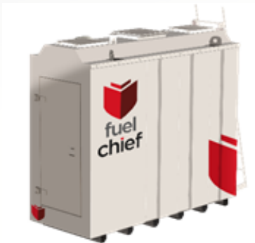
DC50 - 5,000L (4,755 SFL)