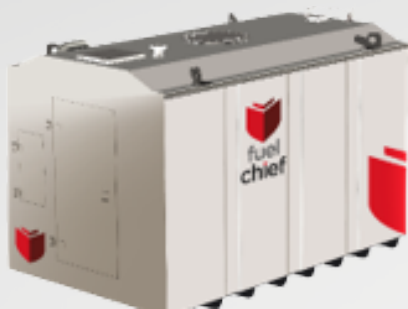
DC150 - 15,000L (14,780 SFL)