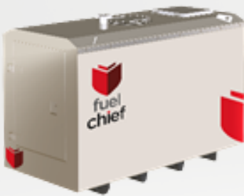
DC25 - 2,500L (2,370 SFL)

The Basic Package is for the client who 'just wants to pump fuel'. With nothing complicated about it, this package features a proven 230v Italian pump system with a mechanical display for each recording of fuel pumped. This ready-to-use package is a great economical choice and at a price that comes in well under budget! Below is a list of the DC Slimline Series Basic package models: