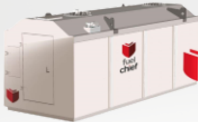
DC200 - 15,000L (18,780 SFL)