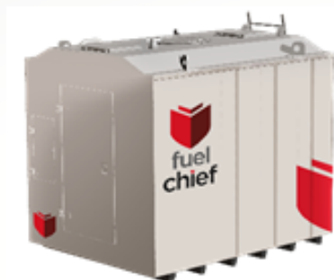
DC100 - 10,000L (9,900 SFL)