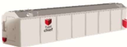
DCD450 - 45,000L (40,860 SFL)