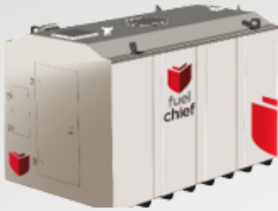
DC150 - 15,000L (14,780 SFL)