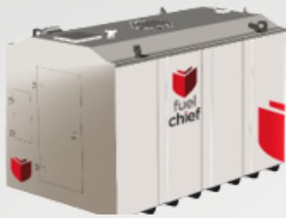
DC150 - 15,000L (14,780 SFL)