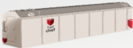
DCD450 - 45,000L (40,860 SFL)