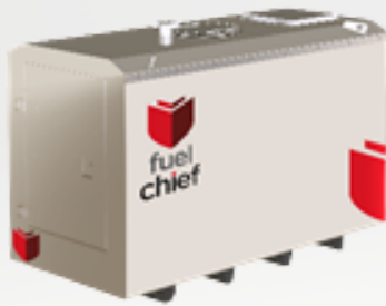
DC25 - 2,500L (2,370 SFL)

The Economy package is for the client who wants to keep a closer eye on monitoring their fuel down to the last litre. This package uses a PIN operated fuel management system (FMS) to ensure security and monitoring. The user simply enters their PIN or keytag and once approved, allows refuelling to happen. There is also the option of entering vehicle registration and kilometres/miles if you wish. This is all set up on the on-board memory that will store up to 255 transactions. The manager key provided with this package is used to download the transaction data and upload to the managers computer that has the correct monitoring software loaded to, where fuel usage reports can be generated and presented to management. Our Economy Series packages are below: