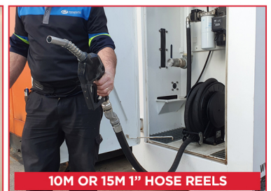
10M OR 15M 1" HOSE REELS