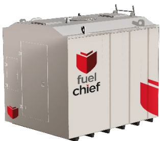
DCD100 Slimline Tank (AUS & NZ) DC100 Slimline Tank (AUS & NZ)