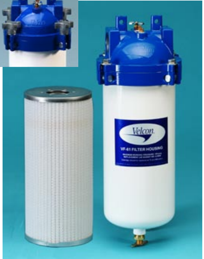
VF-61 shown with standard accessories and (inset) with optional quick release hand bolts.