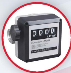
MECHANICAL FLOW METER