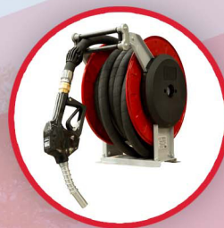
HOSE (Optional Hose Reel)