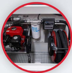
FULL PUMPING PACKAGE (showing optional hose reel)